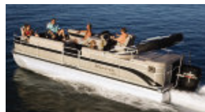
Forward lounge chairs create an optimum seating arrangement, with plenty of space left over.

That was the feel we got for the boat in a recent ocean test at Hawk's Cay Resort and Marina near Marathon Key, Florida. Yep, we ran this pontoon in the salt. Premier's saltwater-corrosion precautions start with heat-sealed, waterproof electrical connectors that keep salt water out. Plenty of sacrificial anodes on the tubes give the boat even more protection against corrosion. Premier uses all aluminum and stainless-steel con-